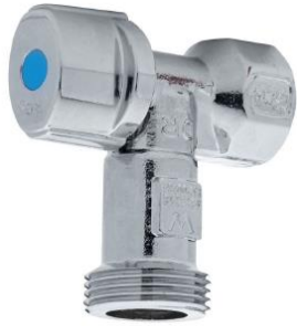
Arco RA W/M Stop & Nrv 20x 15