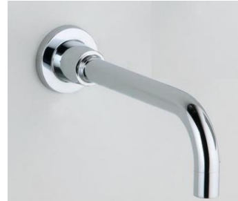
Gen X Bath Outlet