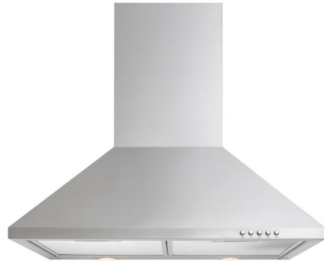
Technika CHEM52C9S-2 900mm Canopy Rangehood