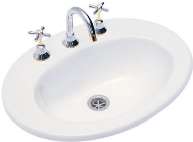
Porcher Heron Vanity Basin