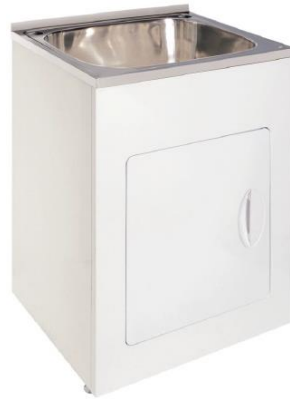
Posh Kensington 45Lt Trough/Cab Bypass.