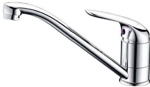
Posh Bristol Mk2 Sink Mixer