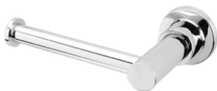
Gen X toilet Roll Holder