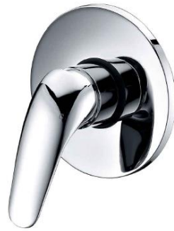
Posh Bristol Mk2 Shower/Bath Mixer