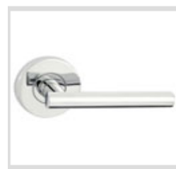
Amelia Passage Set