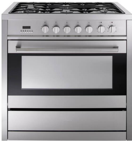
Technika TU950TME8900mm. 900mm Upright Cooker