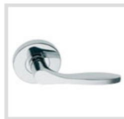
Carla Passage Set