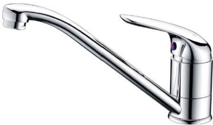
Posh Bristol MK2 Sink Mixer