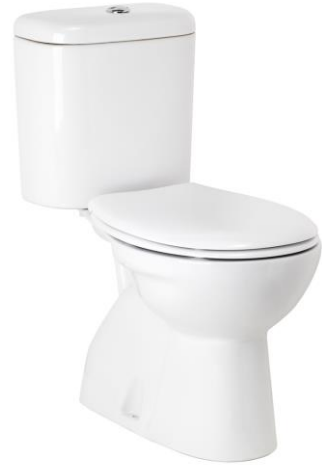
Porcher Heron Toilet Suite.