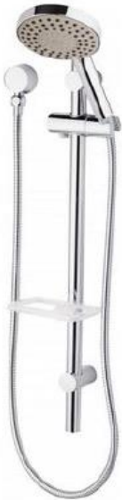
Vivid Hand Shower on Rail