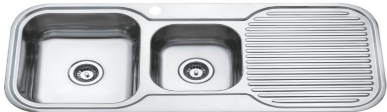
Base MK3 1 3/4 Sink