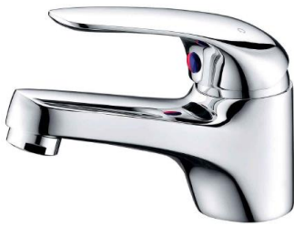
Posh Bristol Mk2 Basin Mixer