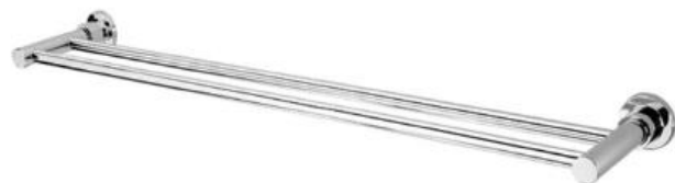
Gen X Double Towel Rail 760mm