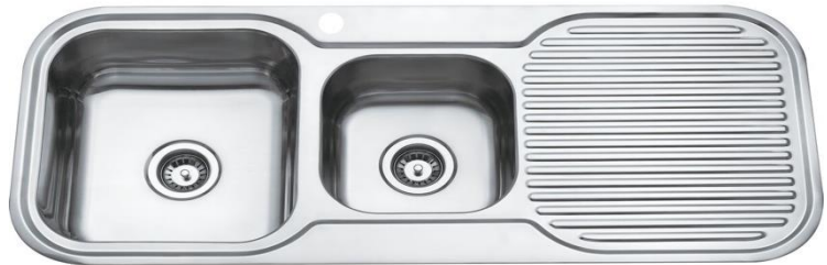
Base MK3 1 3/4 Sink