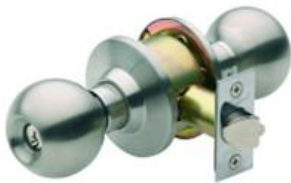
Gainsborough Governor 840 Entrance Set

Entry Lock: Front entry fitted with Gainsborough Governor or TriLock.