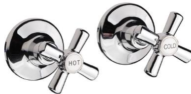
Posh Bristol Wall Top Assembly