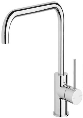
Vivid Slimline line Sink Mixer SQ