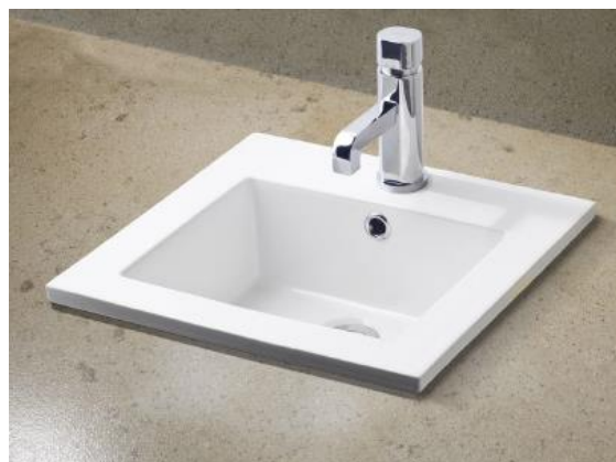
Kado Arc Vanity Basin