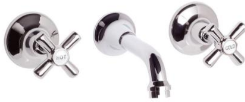
Posh Bristol Bath Set