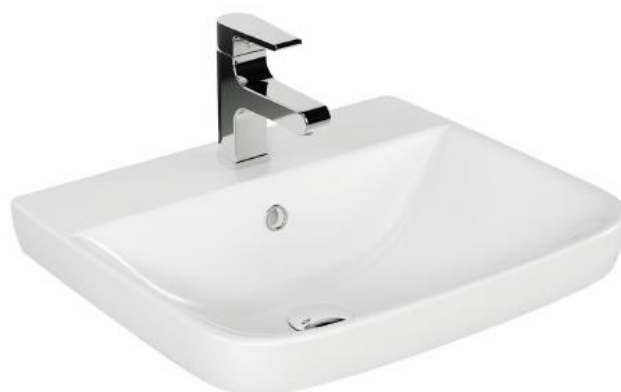
Porcher Cygnet Semi Inset Basin