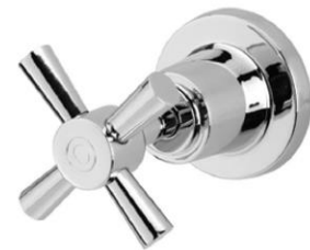
Gen X Wall Top Assembly