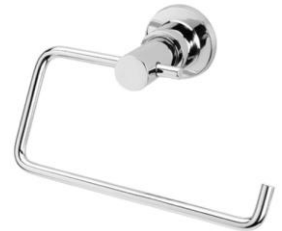
Gen X Guest Towel Holder (To Powder Room only)