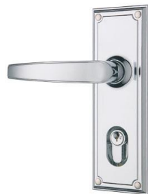
Gainsborough, Tri-Lock Traditional Lever Double Cylinder (840TLE)