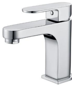
Mizu Soothe Basin Mixer