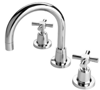
Gen X Basin Set Gooseneck swivel.