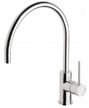
Vivid Slimline Sink Mixer Gooseneck.