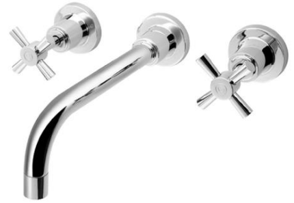
Gen X Bath Set