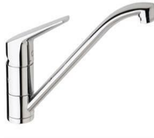
Posh Solus Mk2 Sink Mixer