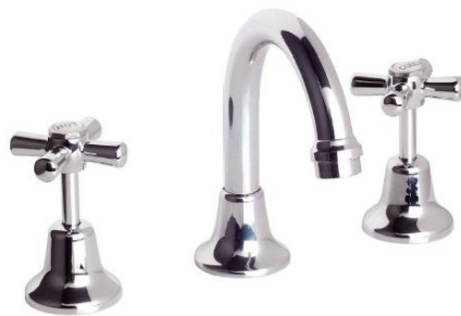
Posh Bristol Basin Set swivel