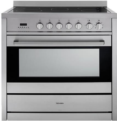
Technika CERHE09PSS-2 Ceramic 900mm Upright Cooker.