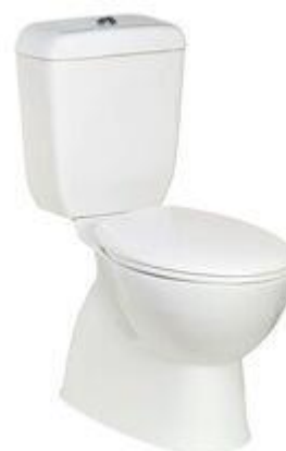
Posh Dominique Toilet Suite.