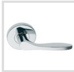
Carla Passage Set