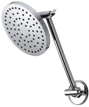
Methven Krome Hi-Rise Shower Hangsell