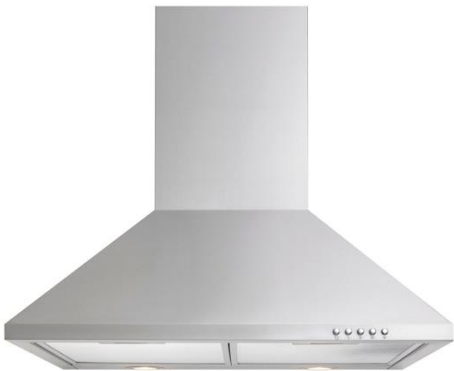
Technika CHEM52C9S-5. 900mm Canopy Rangehood