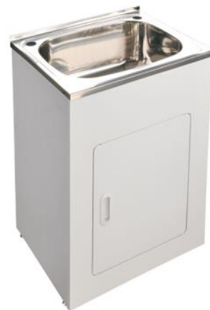
Base 45 Litre Trough/Cabinet with Bypass. (Plan Specific)