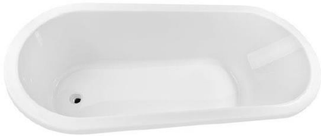
Decina Uno 1700 Bath.