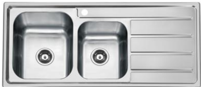
Posh Solus MK3 1 3/4 Sink