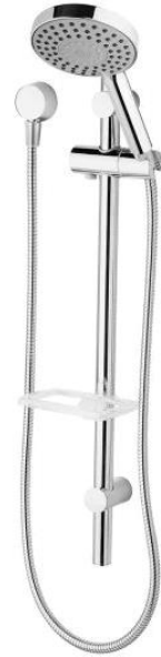
Vivid Hand Shower on Rail