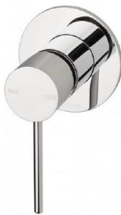
Vivid Slimline Shower/Bath Mixer