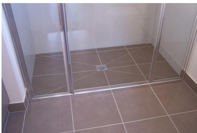
Tiled Instu shower base to all showers.