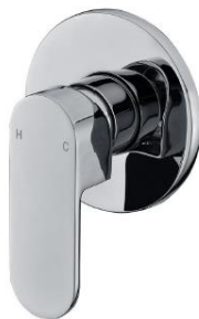
Mizu Soothe Shower/Bath Mixer