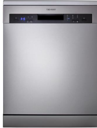
Technika TDX7SS-6. Stainless Steel Dishwasher.