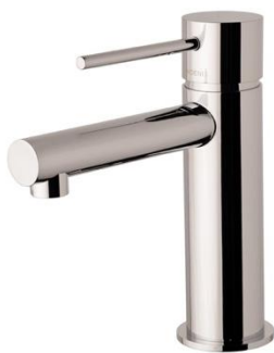
Vivid Slimline Basin Mixer