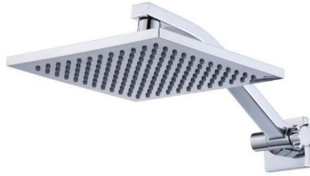
Caroma Quatro Adjustable Shower