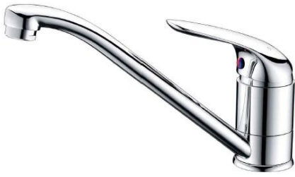
Posh Bristol Mk2 Sink Mixer

Select from our standard range of the following: