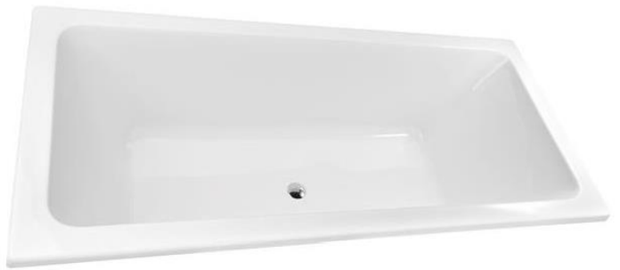
Carina 1675 Bath.