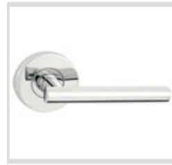
Amelia Passage Set