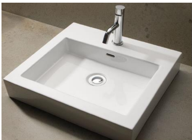
Kado Lux Counter Basin