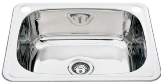
Base SS Drop in Trough 45 Litre with Bypass. (Plan Specific)